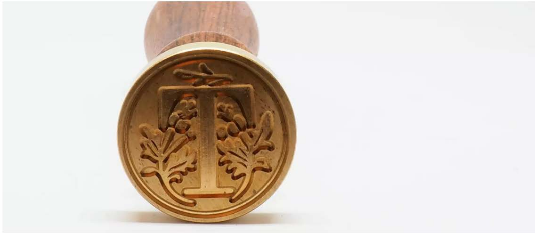
Time for T?