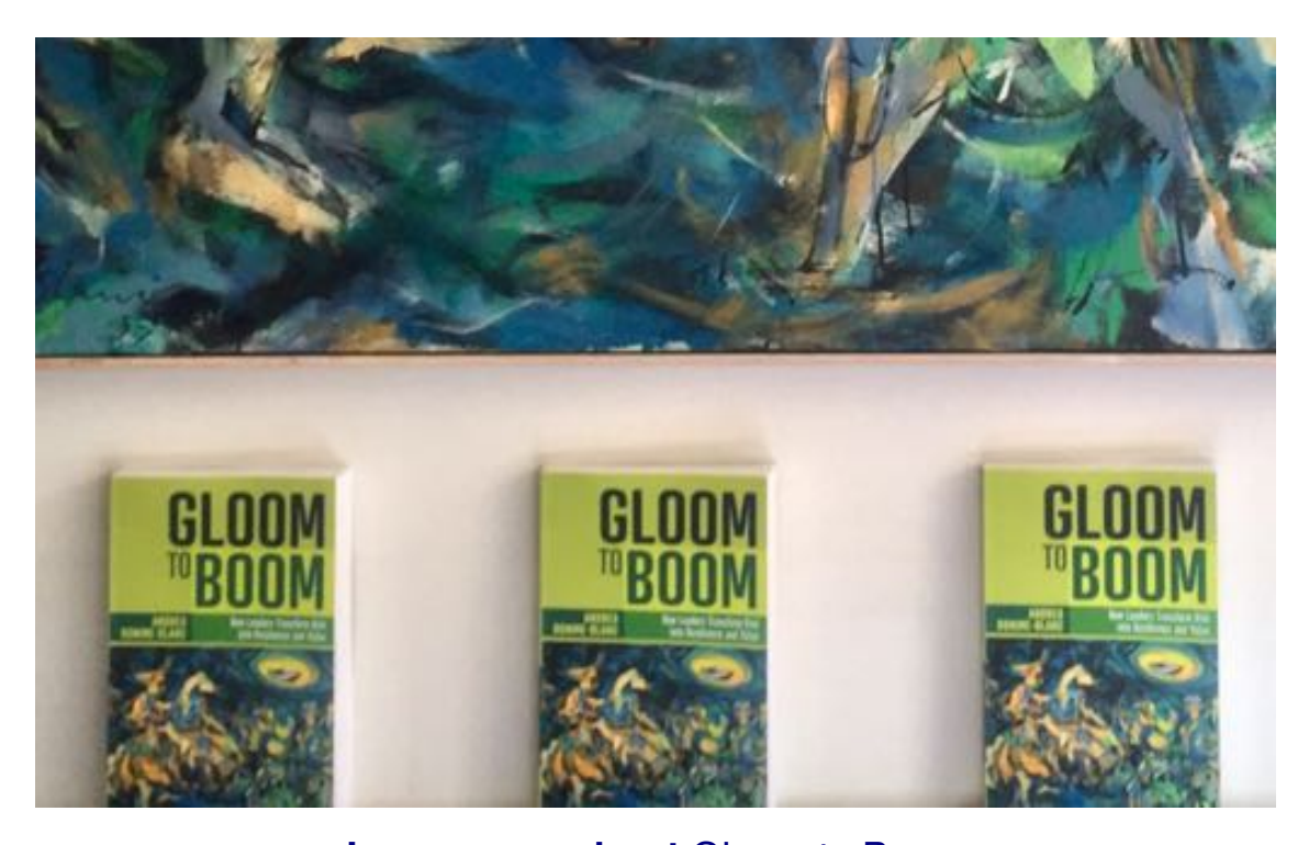
Learn more about Gloom to Boom